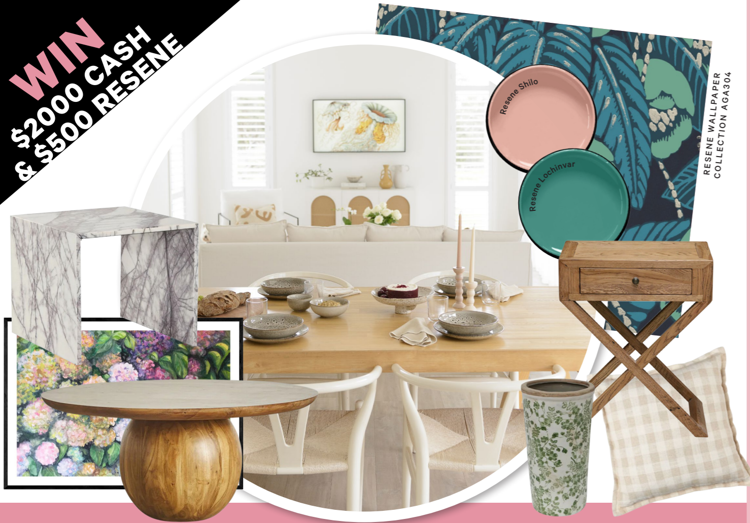
RESENE WALLPAPER COLLECTION AGA304